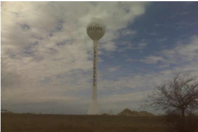
Cresson Crossroads Cresson, TX

Commercial and Industrial lots in Cresson Crossroads. Great site for an oil and gas related company.