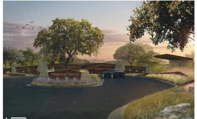
PROJECT NAME: MADRONE CANYON DATE: 07/31/2020 DRAWING: CONCEPTUAL DESIGN PACKAGE PAVILION PARK AREA PERSPECTIVE

One of the largest remaining lots available in Madrone Canyon. Madrone Canyon is on track to be one of the preeminent luxury communities in the Bee Cave area. Please check the attachment for artistic renditions of the gated entrance, pavilion area and landscaping throughout the community. This lot is located in back of the neighborhood with very little traffic. The lot is relatively level with many mature trees. This property feeds into the awarding winning Lake Travis ISD. The dedicated builder for this lot is Eppright Homes. Please check attachments for additional information. To access disclosures and other details about this property, go to: https://wkf.ms/3ERyvTh