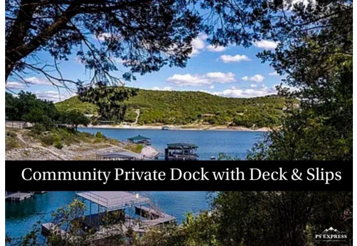
Community Private Dock with Deck & Slips