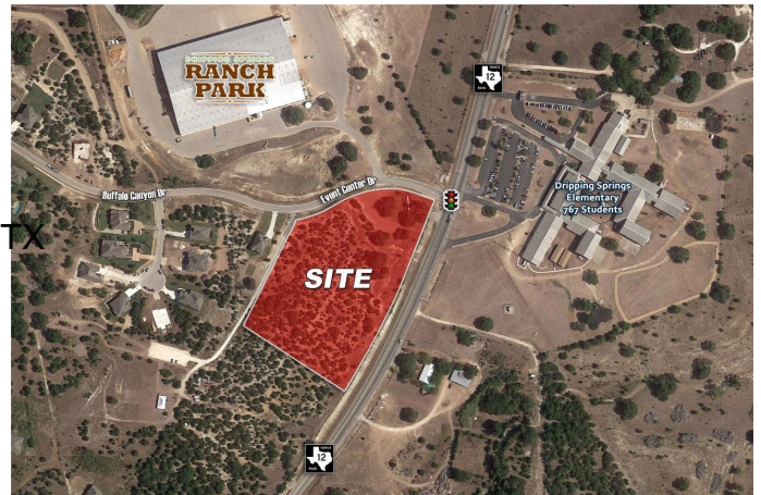
Prime Commercial Development Opportunity in Dripping Springs SWC RR 12 and DS Ranch Road - Excellent site for Office, Retail Development FOR SALE

Excellent hard corner site at the intersection of RR 12 and DS Ranch Road. Great location for a combination of Retail and Office or Flex space. Property Zoned General Retail (GR) with all utilities at site. Property has 805 feet frontage on Ranch Road 12 & 567 feet on DS Ranch Road. Across the street from Dripping Springs Event Center. Across the street from Double L Ranch - 1677-acre master planned community in Dripping Springs. Drippings Hill has had tremendous population growth in the last 10 years with new subdivisions along RR 12 and US 290. * Buyer is to verify all information regarding zoning, permitted uses, utilities, etc.